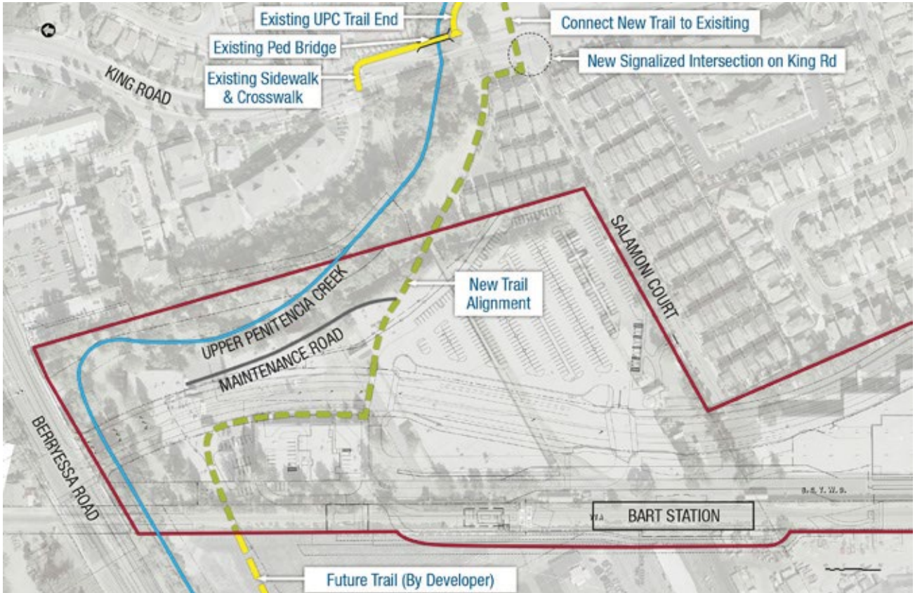
Draft Alignment Map