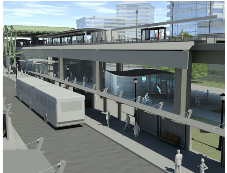
The Upper Penitencia Creek Trail Connector will provide direct access to the Berryessa BART Station indoor bicycle storage room, shown here under the elevated guideway adjacent to the north station entrance.