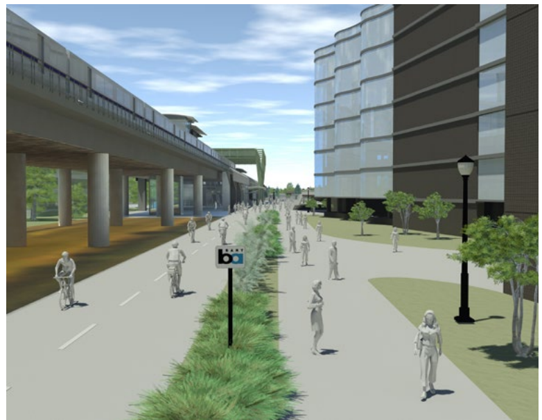
In addition to station access from King Road via the proposed Upper Penitencia Creek Trail Connector, bicyclists and pedestrians will have dedicated bike-only and pedestrian-only paths from Mabury Road, shown here looking north.