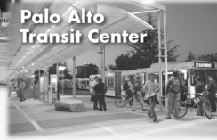
Palo Alto Transit Center