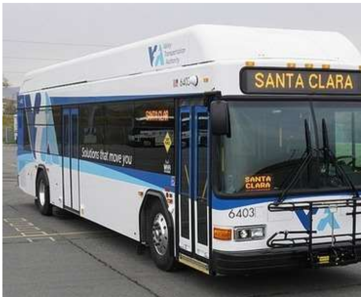
VTA's fleet of buses and trains will gradually sport a redesigned logo and new colors